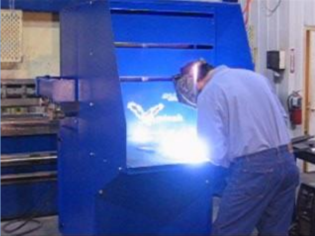
Captures Welding, Grinding and Polishing Fumes and Smoke. Made in the USA.