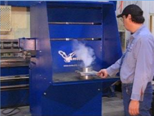
Removes Contaminates from the Breathing Area of the Operator.