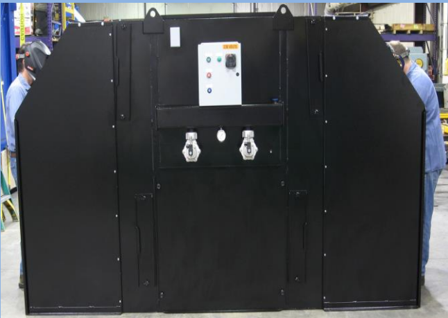
Dual Station BDB-4000D. Custom Color.