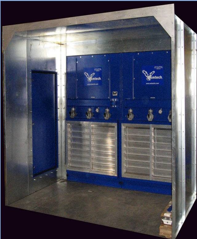
DOUBLE EBM-6 WITH BOOTH AND SIDE DOOR Made in the USA.